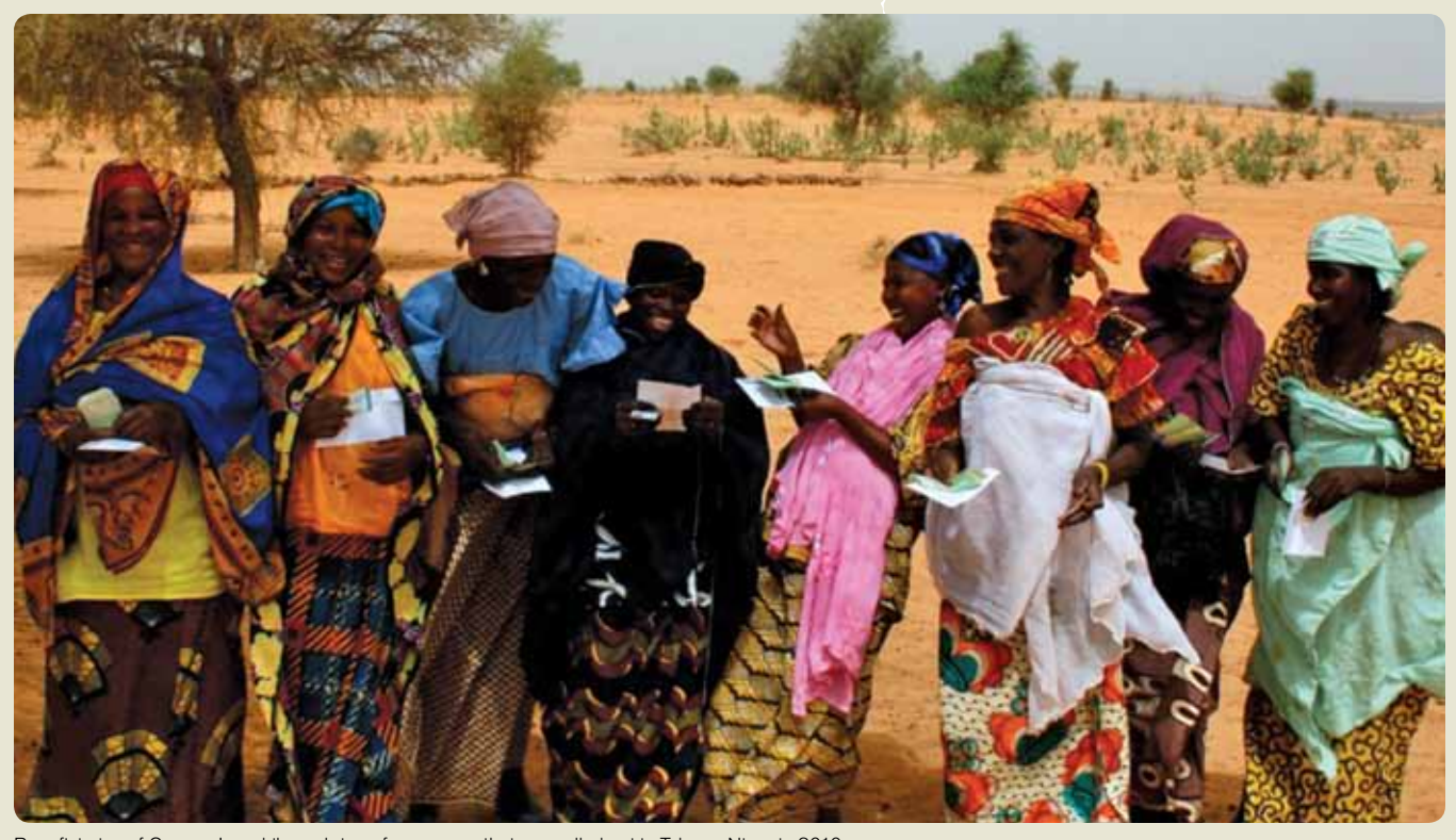
Beneficiaries of Concern's mobile cash transfer program that was rolled out in Tahoua, Niger in 2010.