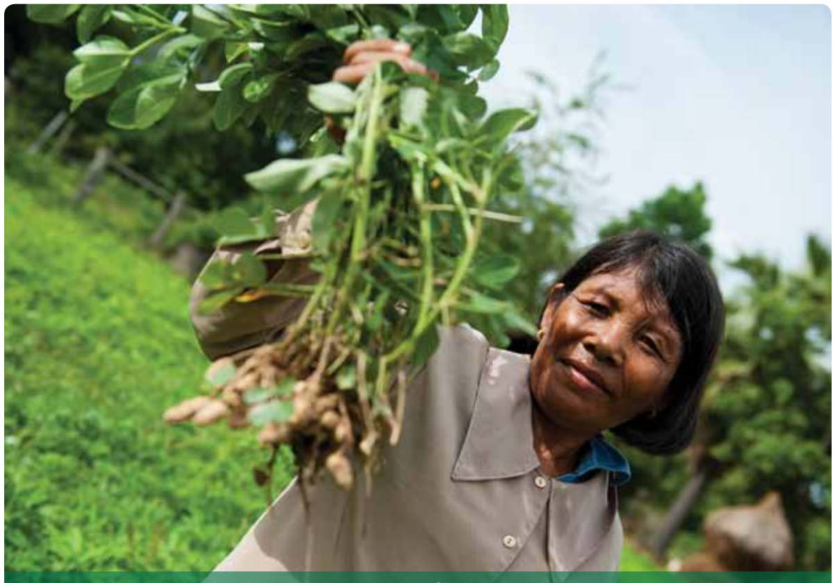
Local farmer shows off a freshly pulled peanut plant on her farm. She has taken advantage of the integrated farming techniques and now grows limes, peanuts, bananas, green beans, chilis, and more.

Investment in smallholder farmers can lead to both improved household food and nutrition security and wider economic impact. A Concern Worldwide case study in Rwanda demonstrates that with a targeted package of support to increase agricultural productivity and link to savings programs, farmers with small plots of land were able to triple their crop productivity and improve crop diversity. Households also increased food consumption and dietary diversity, started to employ other people, and built resilience to external shocks such as erratic rainfall or illness in the household.<sup>21</sup>